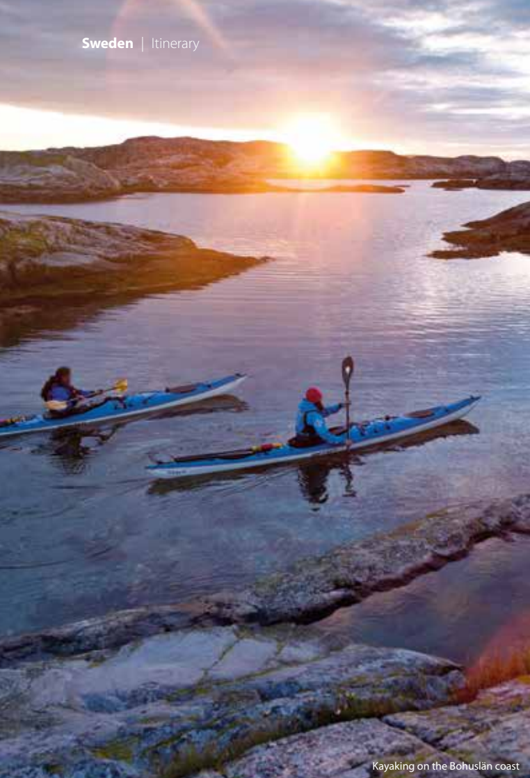
Kayaking on the Bohuslän coast