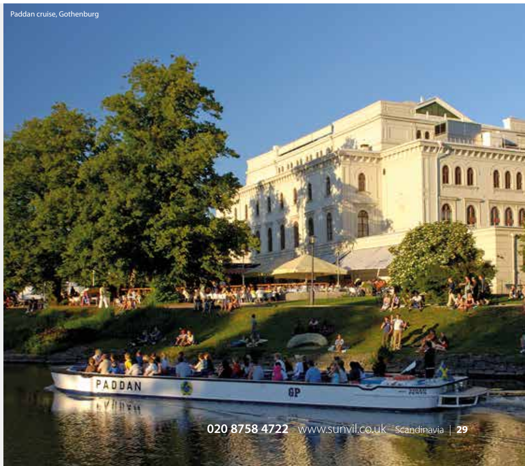
Paddan cruise, Gothenburg

Guide price based on 2-sharing from £844 per person